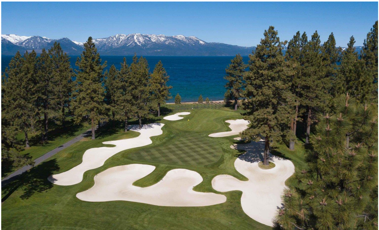
The 16th hole at Edgewood Tahoe