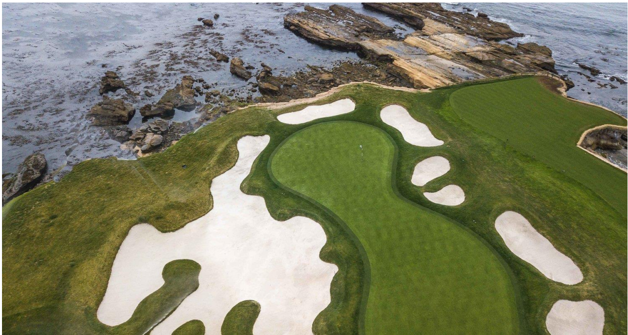
The 17th at Pebble Beach Golf Links