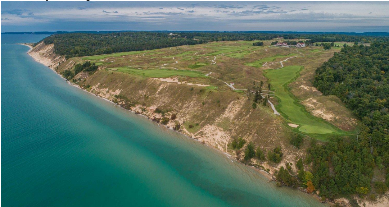
The aptly named Arcadia Bluffs in Michigan.

Depending on how you set up the trip, there can be a decent amount of traveling involved on a buddies trip to Michigan.