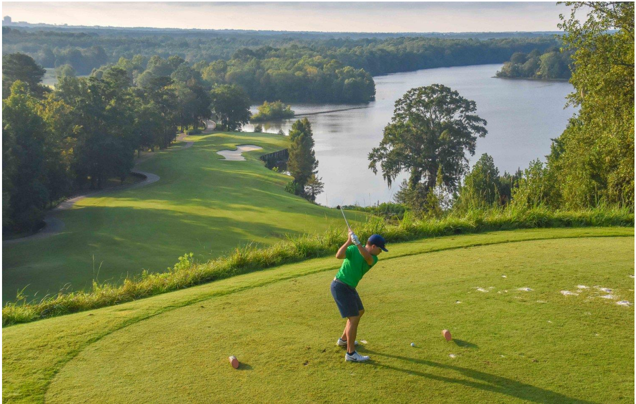
The opening hole on Capitol Hill's Judge course.

Throughout the fine state of Alabama you will find a sprinkling of high quality golf courses all designed by Robert Trent Jones. It is the Robert Trent Jones Golf Trail and It is without a doubt, the greatest value for golf in the entire country. There are 10 golf courses in total and you probably won't have time to play them all, so you will need to plan your route accordingly.