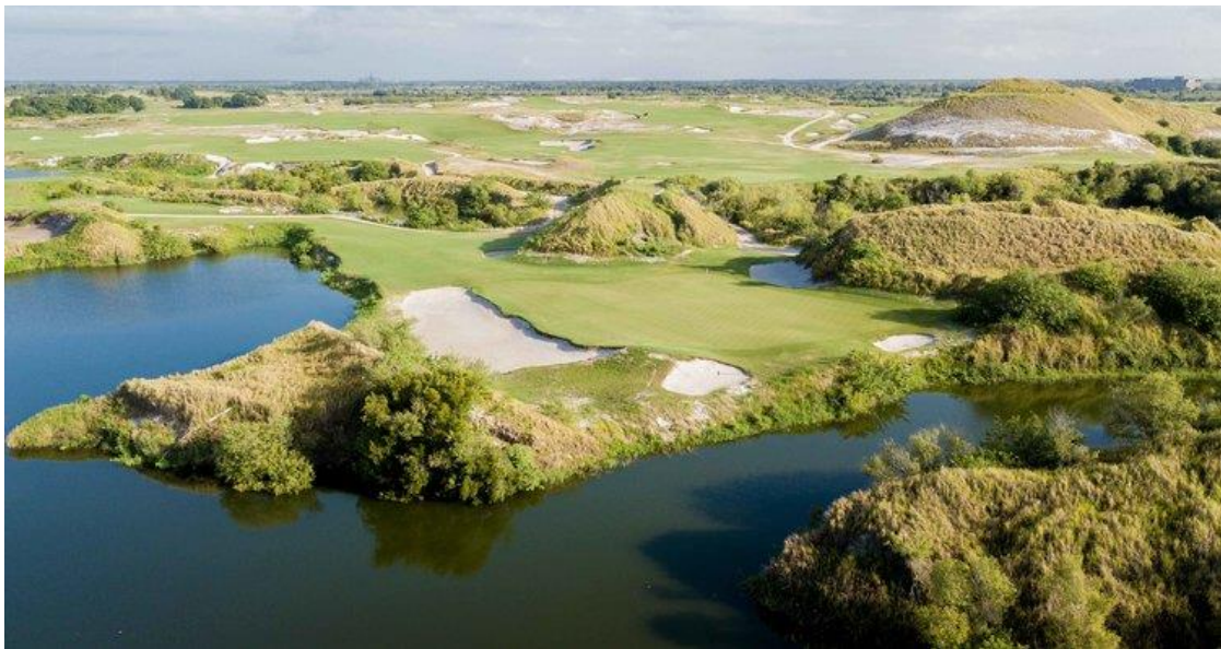
The red course shines.