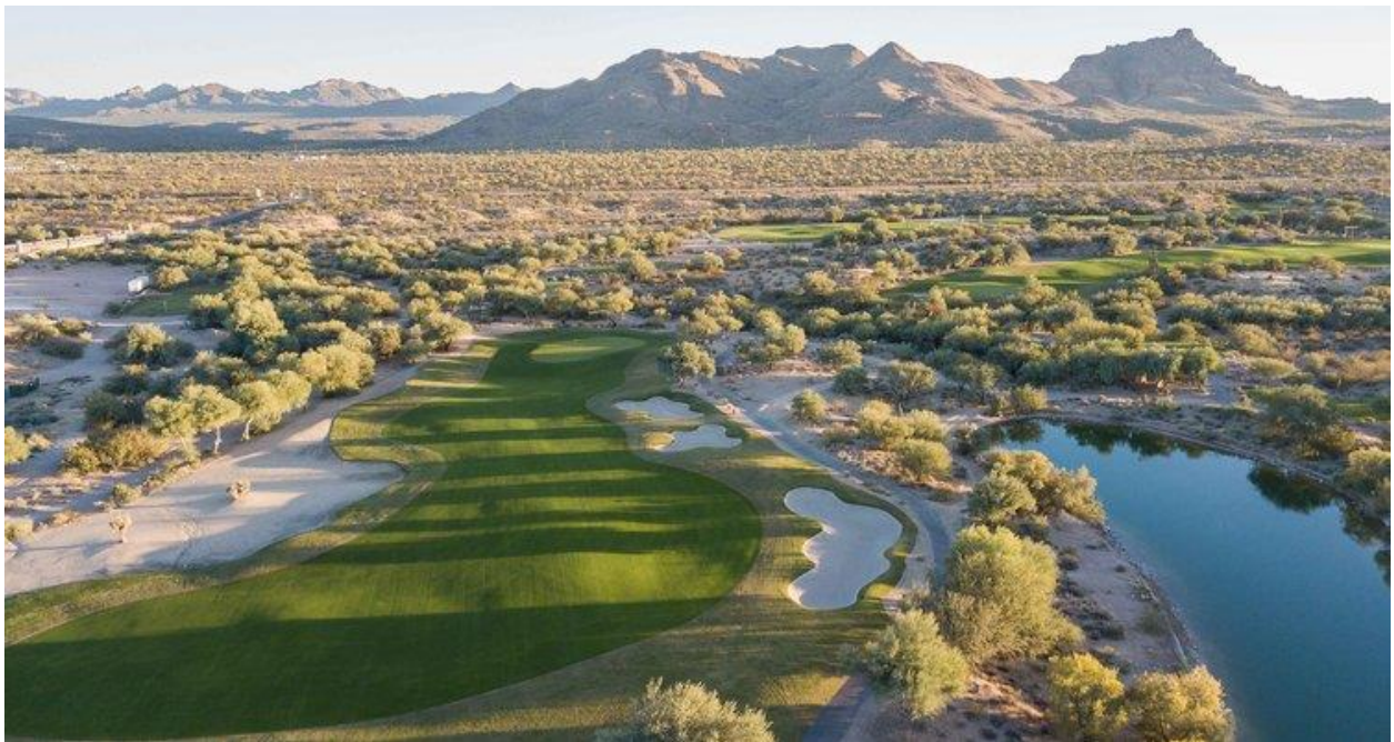
We-Ko-Pa is my go to option for public golf in Scottsdale