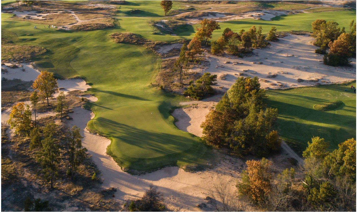
Coore and Crenshaw's Sand Valley

Sand Valley is a part of the Dream Golf umbrella that includes places like Bandon Dunes and Cabot Cliffs. So it is safe to say that the formula for success is alive and well at Sand Valley. With 2 championship layouts and a short course already in place, this destination will only improve as time moves forward and new golf is added. The lodging is also deliciously close to the golf courses and the dining is just as tasty.