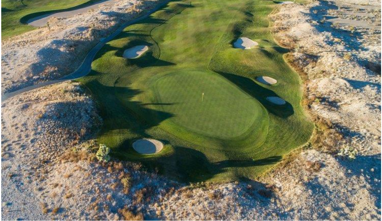
Paiute's Wolf Course