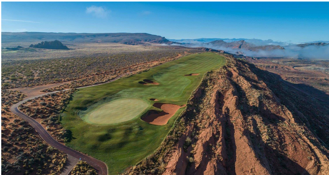
The 14th hole at Sand Hollow