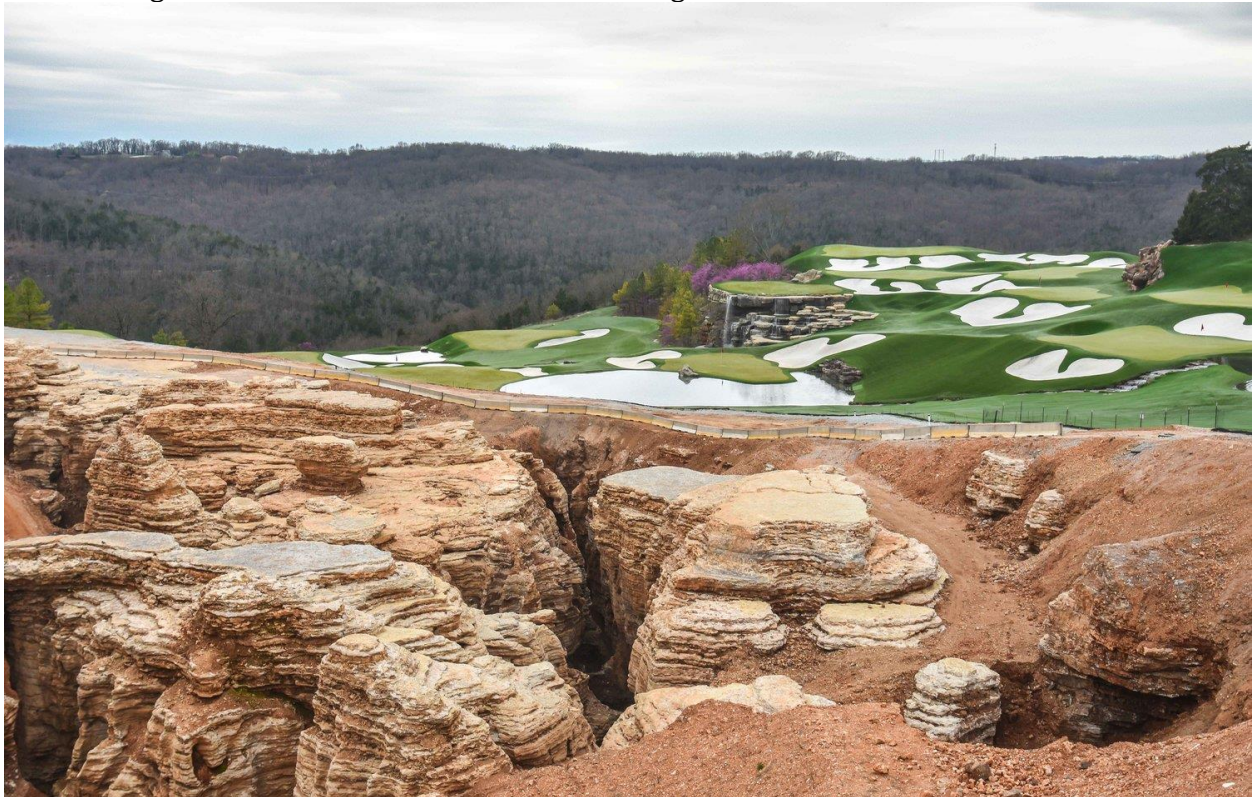
A giant sinkhole has been excavated in front of the range at The Top of The Rock.

Since Big Cedar Lodge is technically a Wilderness lodge, golf is not the main focus. A quick scan of the “things to do” section revealed about 20 non golf related activities.