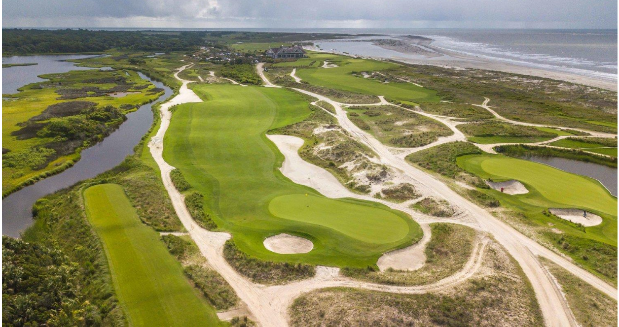
Kiawah Island's Ocean Course.

The Pete Dye designed Ocean Course is guaranteed to give you an experience that you will remember for years. Fortunately, the resort has 4 other great options to round out your golf experience with Cougar Point, Osprey Point, Turtle Point, and Oak Point. The point is... there is plenty of good golf to play at Kiawah Island.