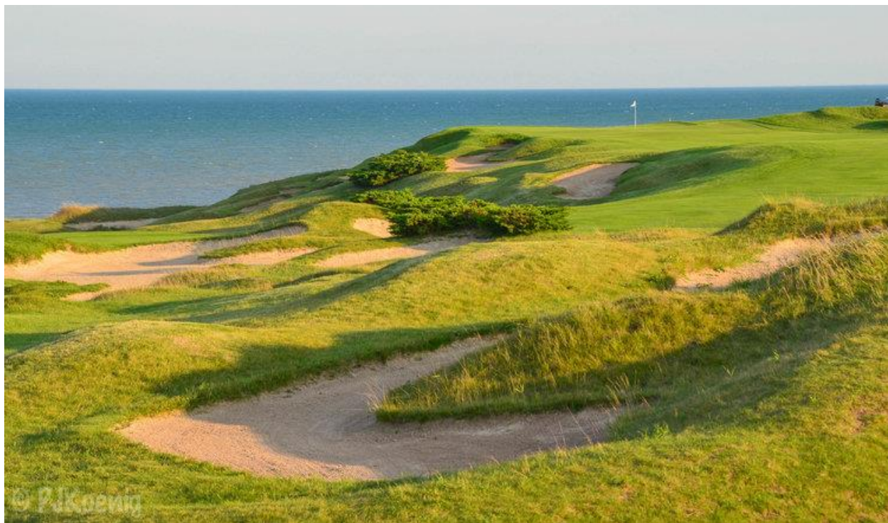
The 16th at Whistling Straits