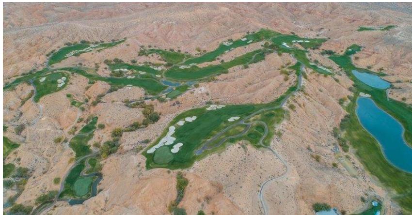
The golf roller coaster, Wolf Creek