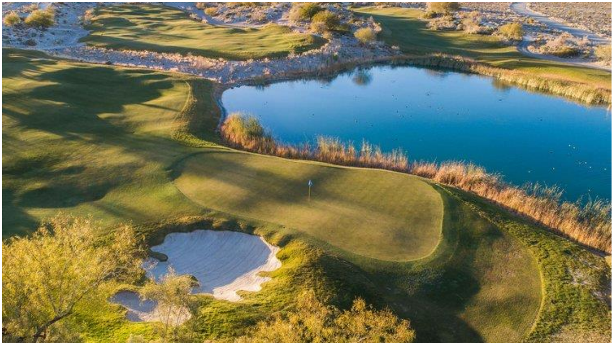
Nicklaus' Coyote Springs