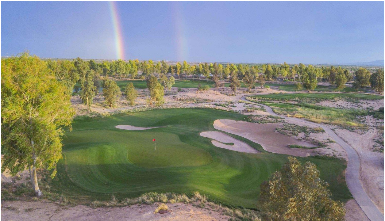
A double rainbow over the 11th hole at Southern Dunes