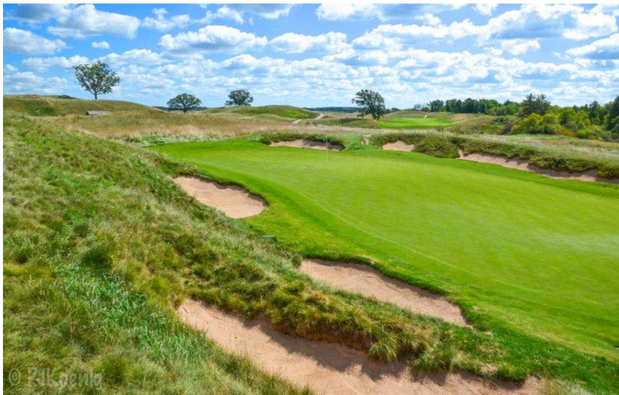
The 16th hole at Erin Hills