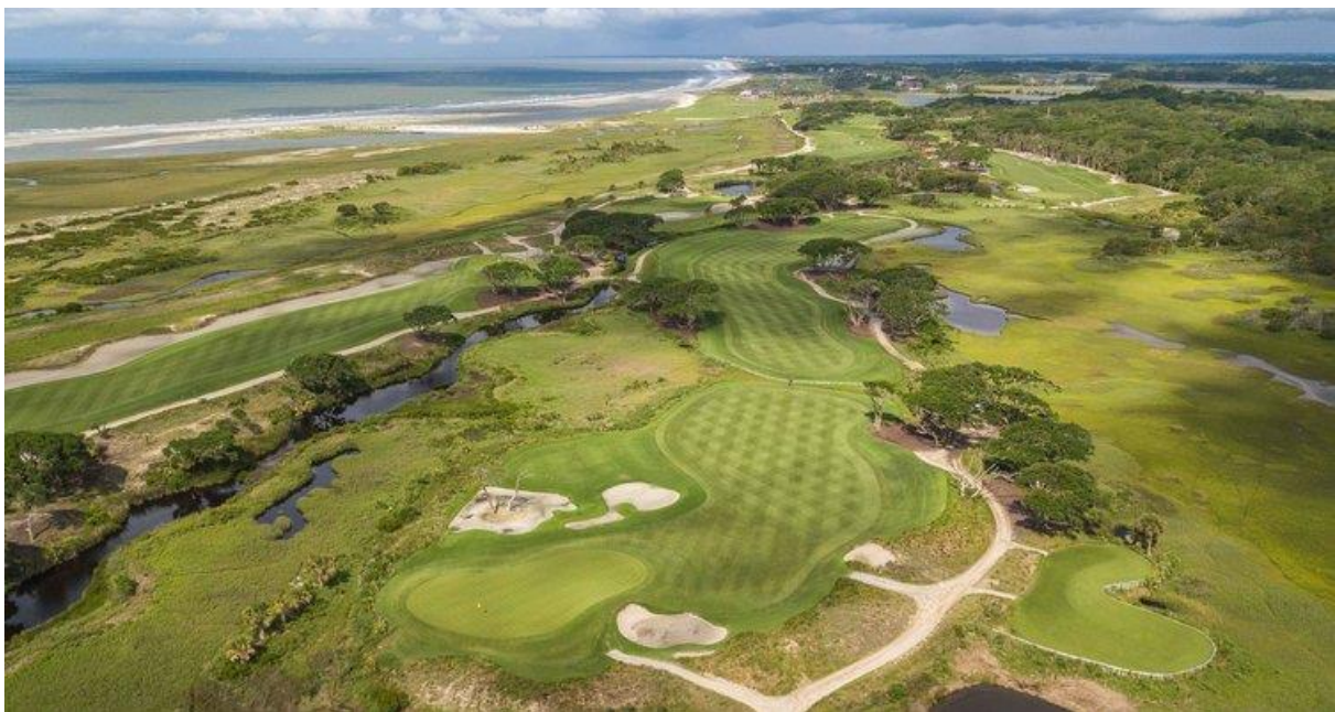
The front nine of the Ocean Course at Kiawah Island.