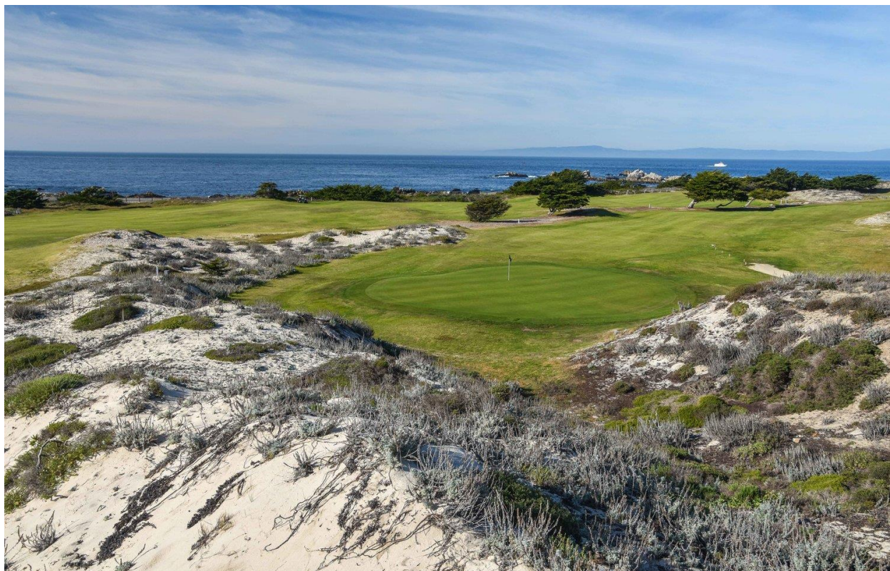
Pacific Grove Golf Links is on my list of must plays in Monterey.