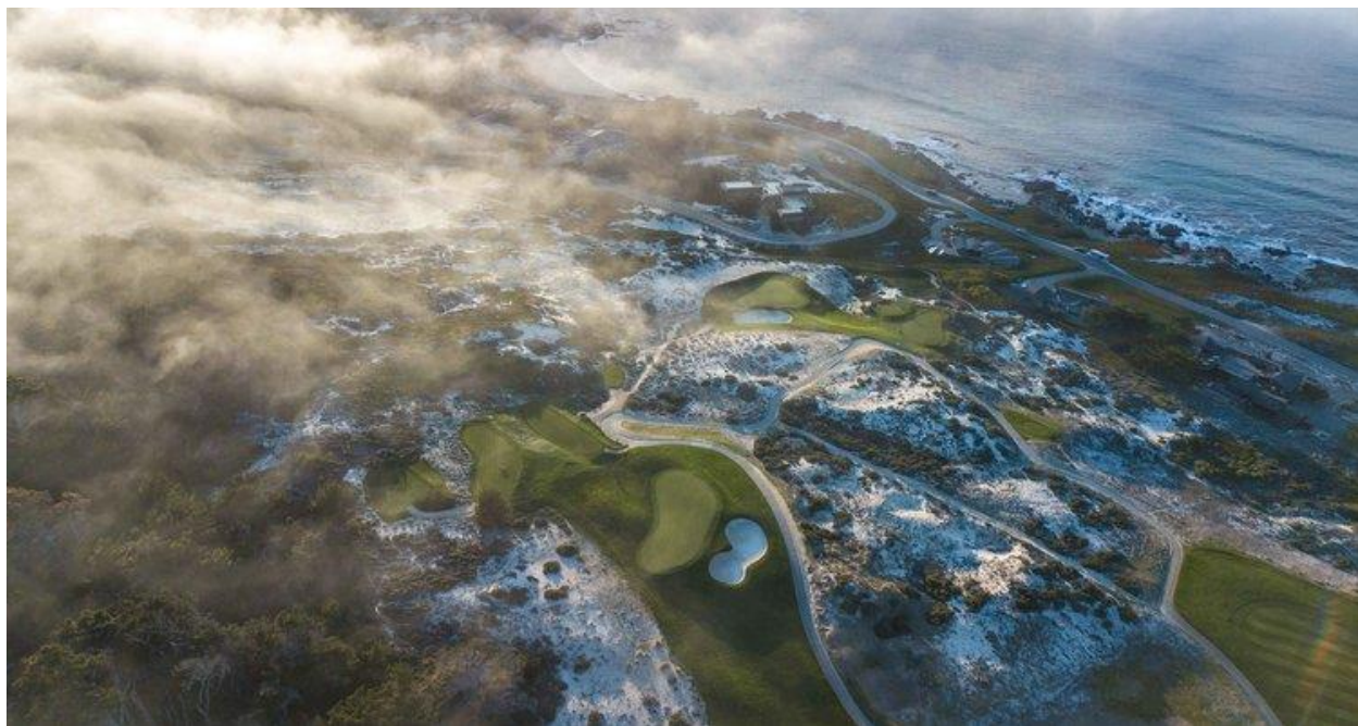
The 2nd and 3rd holes at Spyglass Hill