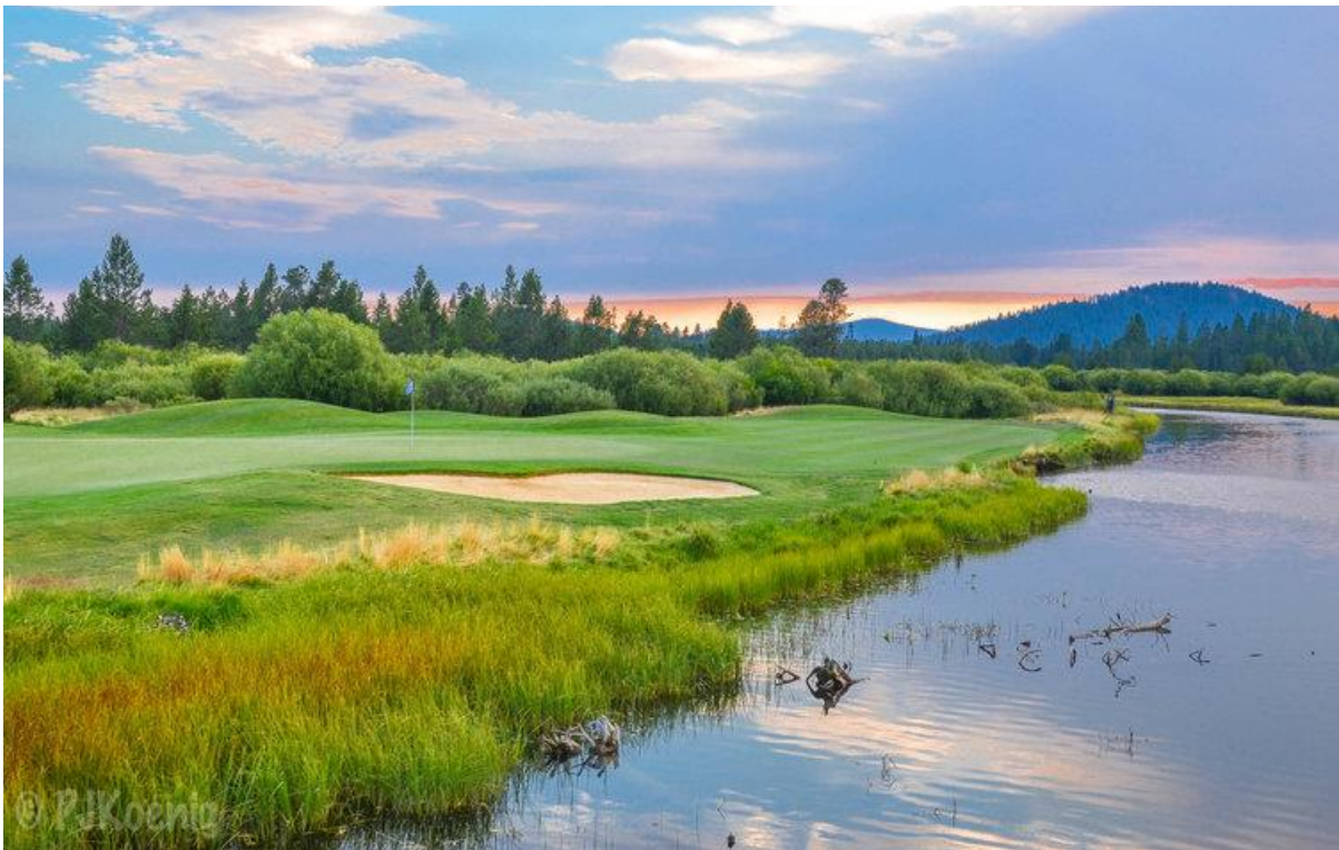
The finishing hole at Crosswater.