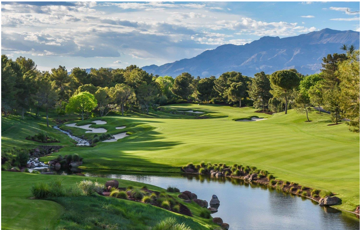
Tom Fazio's Shadow Creek