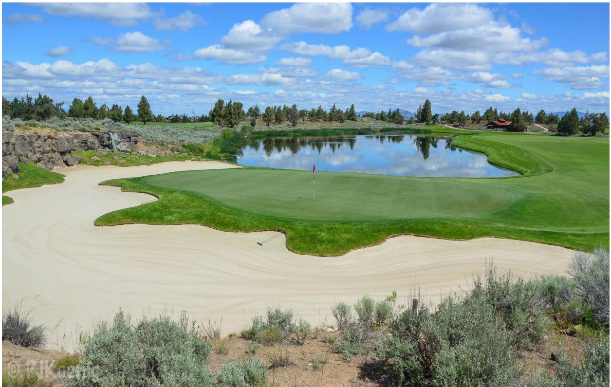
The Nicklaus Course at Pronghorn.