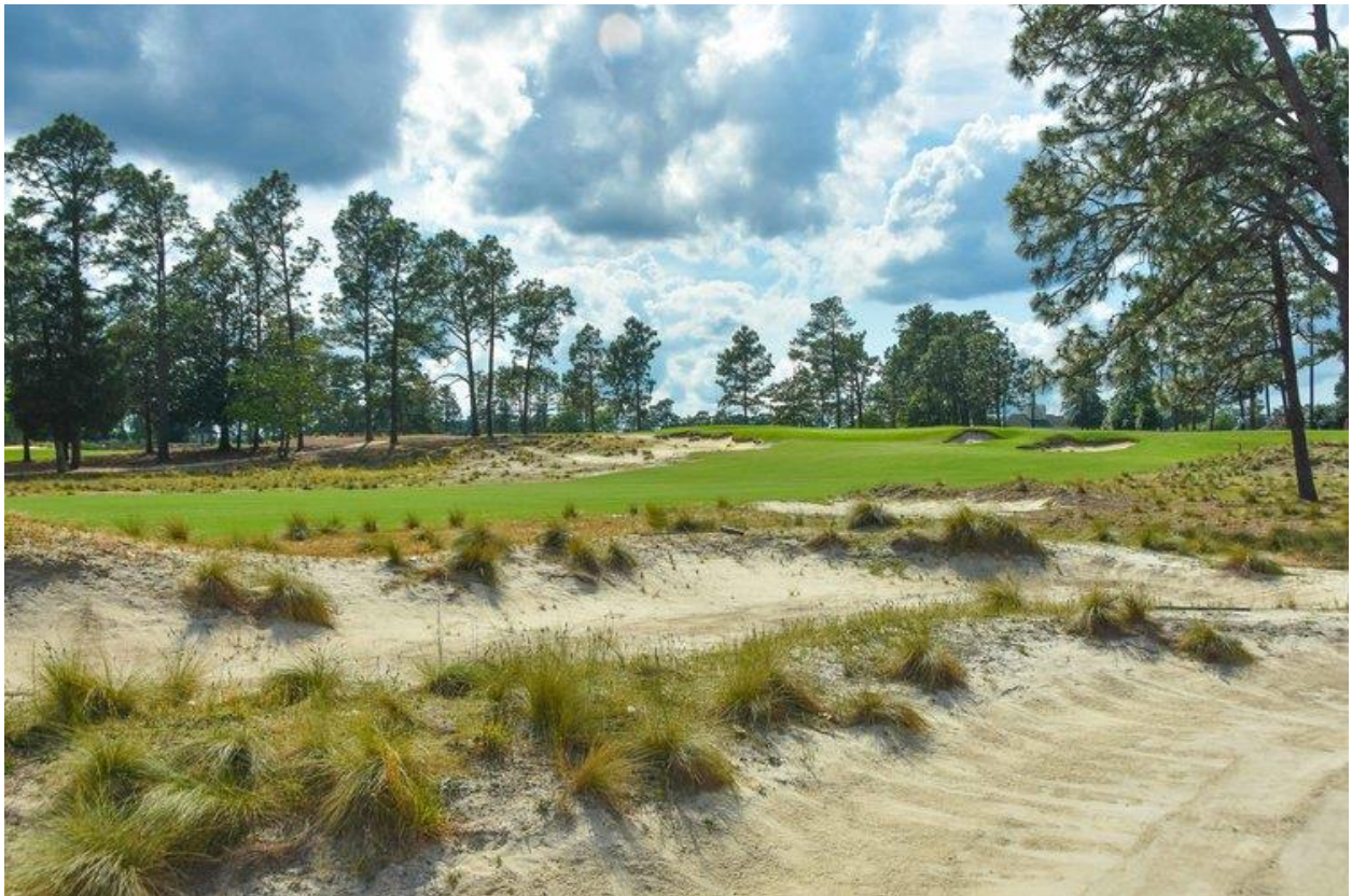
Pinehurst #2 has been returned to its sandy Ross roots.