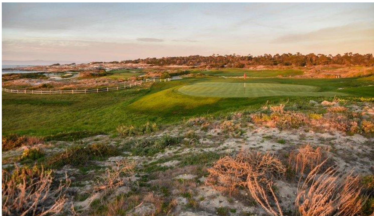
The 14th hole at Spanish Bay