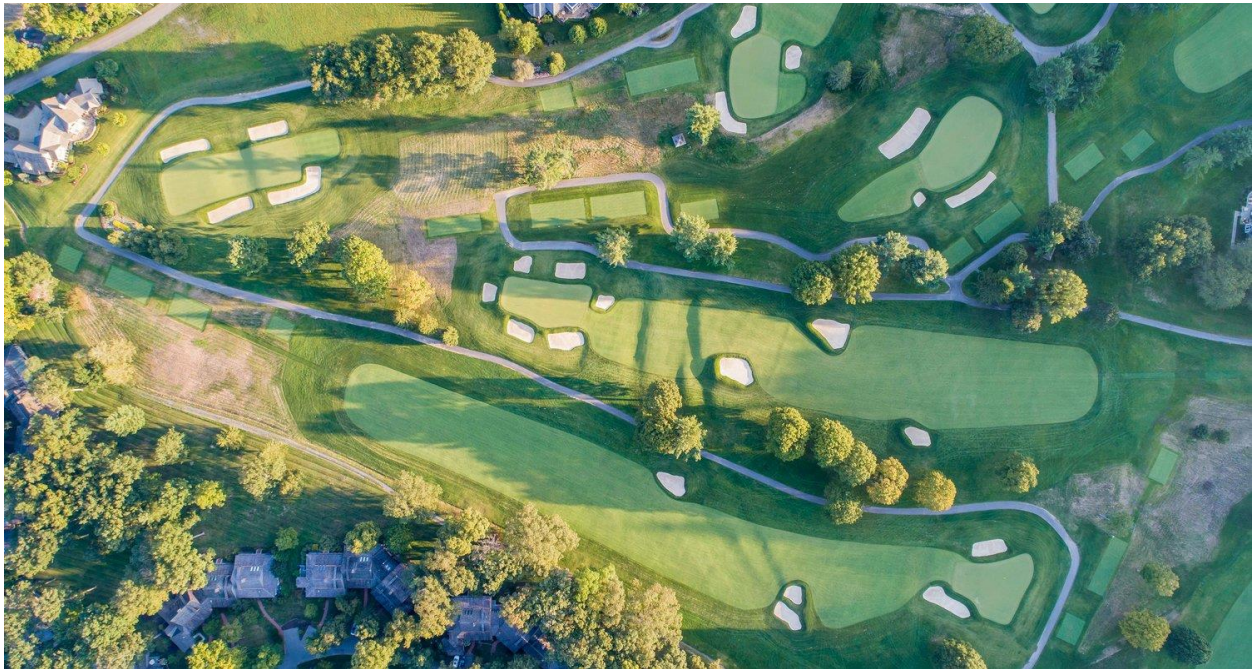
The Old White TPC course at The Greenbrier.

Head on out to Slamming Sammy's after your round on the Old White TPC or the Meadows course.